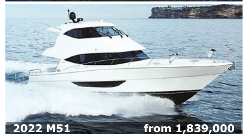
2022 M51 from 1,839,000