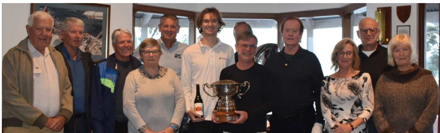
facing page, left to right