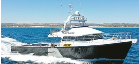
2016 Southerly Designs $3,800,000