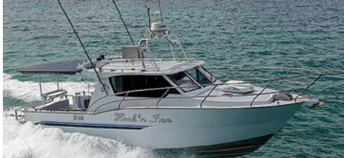
2007 Calibre 10m $185,000