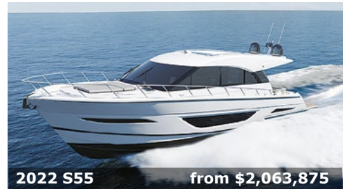
2022 S55 from $2,063,875