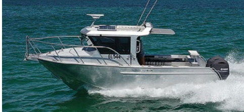
2019 Air Rider $250,000