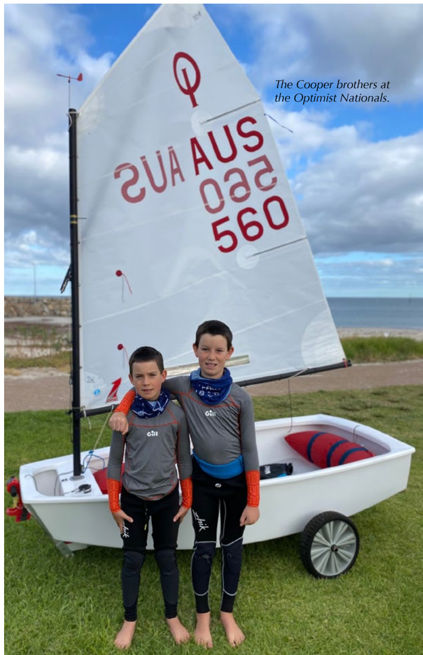
The Cooper brothers at the Optimist Nationals.