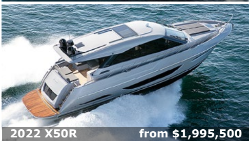
2022 X50R from $1,995,500