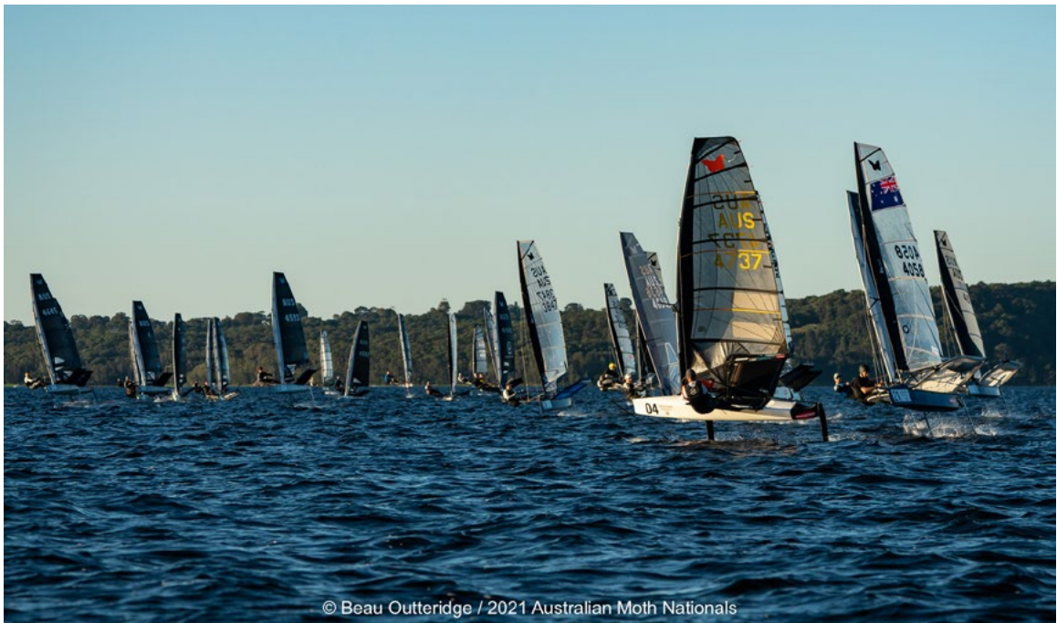
2021 Australian Moth Nationals