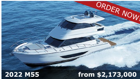
2022 M55 from $2,173,000