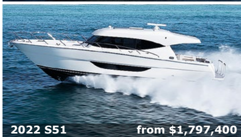
2022 S51 from $1,797,400