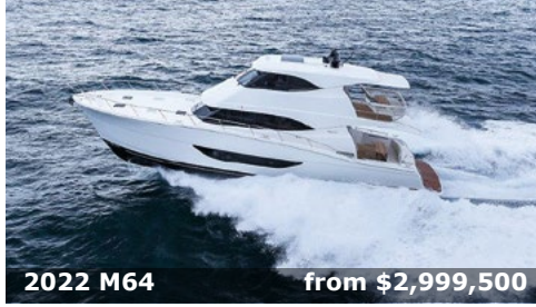
2022 M64 from $2,999,500