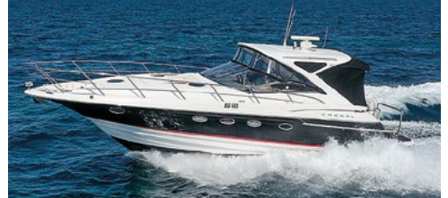
2008 Regal 4460 $340,000