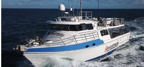
2002 Phil Curran 63 $799,000