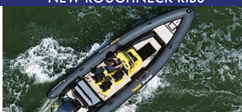
Roughneck 808 from $125,000