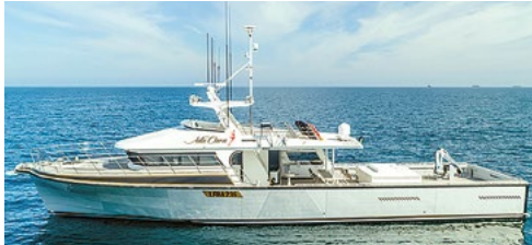
2018 Global Marine $POA