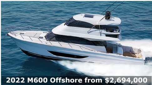
2022 M600 Offshore from $2,694,000