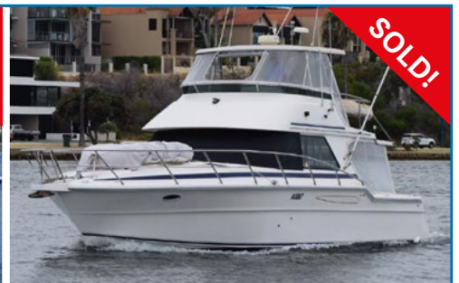
THOMASCRAFT 43 $229K