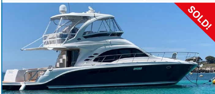
52 SEA RAY ¼ SHARE $120K

Thinking of selling? More stock urgently needed! Cash buyers waiting.