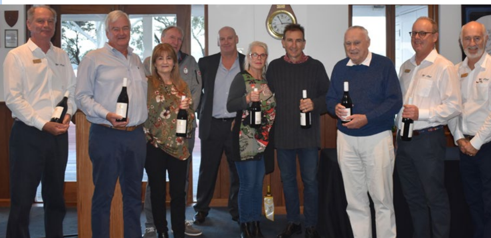
above left: RFBYC Volunteers, thank you!

Our offshore season closed with the Roland Smith Ocean Race on Saturday 17 April 2021. A popular coastal race inside Rottnest Island and the Perth coastline. ■