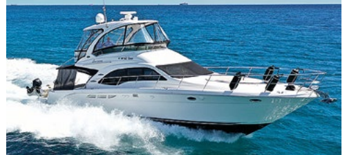
2007 Sea Ray 52 $595,000