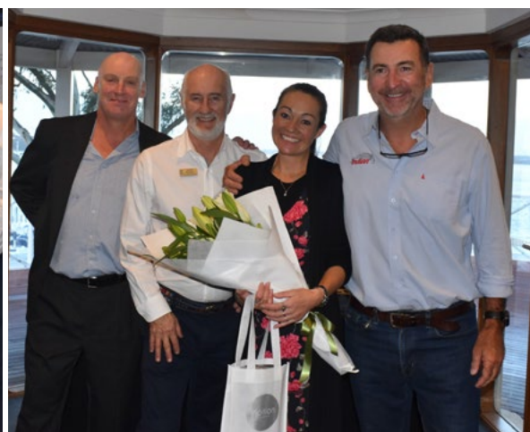
above right: Team RFBYC Offshore Racing.

facing page, above: Checkmate, second overall. facing page, below: Obsession, third overall.