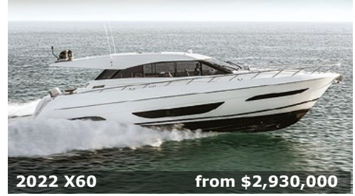
2022 X60 from $2,930,000