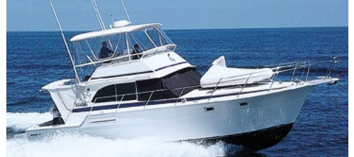
1989 Bertram 42 Flybridge $195,000