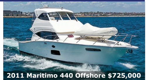
2011 Maritimo 440 Offshore $725,000