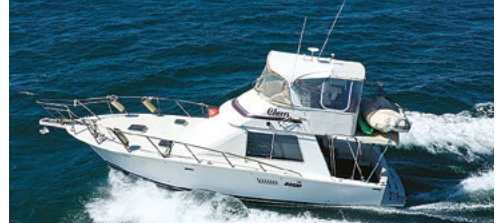
1989 Prestige Flybridge $85,550