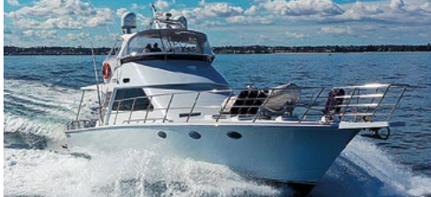
1990 Precision 17 $499,000