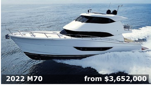
2022 M70 from $3,652,000