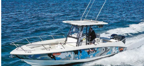
2007 Boston Whaler 320 $189,000