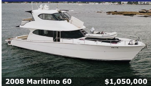
2008 Maritimo 60 $1,050,000

Tom Lovelady: 0417 780 566 Matt Lovelady: 0499 449 788 Lochie Boyd: 0428 945 211