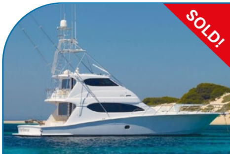
HATTERAS 68 CONVERTIBLE $1.95M