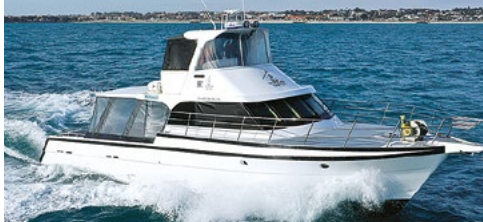
2003 Westcoaster 53 $475,000