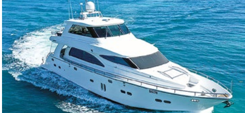
2007 Horizon E73 $1,899,000