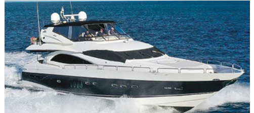
2005 Sunseeker 94' $2,500,000