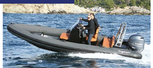
Roughneck 636 from $79,000