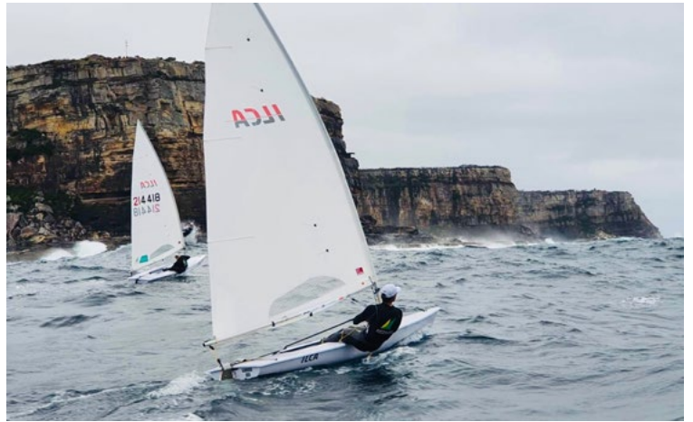
above: Sailing out of the Heads in Sydney

The ability to go interstate last year, and currently this year is possible due to the big support network at home. A big thanks to RFBYC for their ongoing support with my sailing as I continue to learn and gain more experience in my laser campaign.