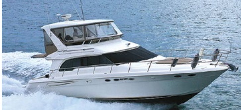
1999 Sea Ray 480 $330,000