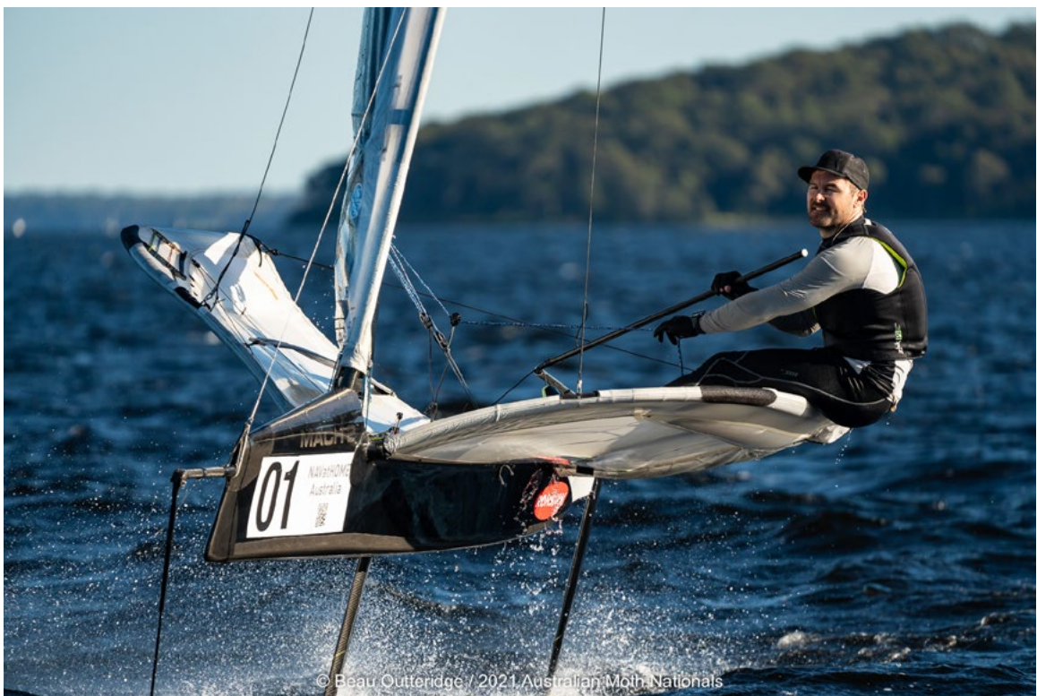
© Beau Outteridge / 2021 Australian Moth Nationals