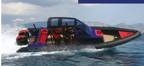
Roughneck 1010 from $269,000