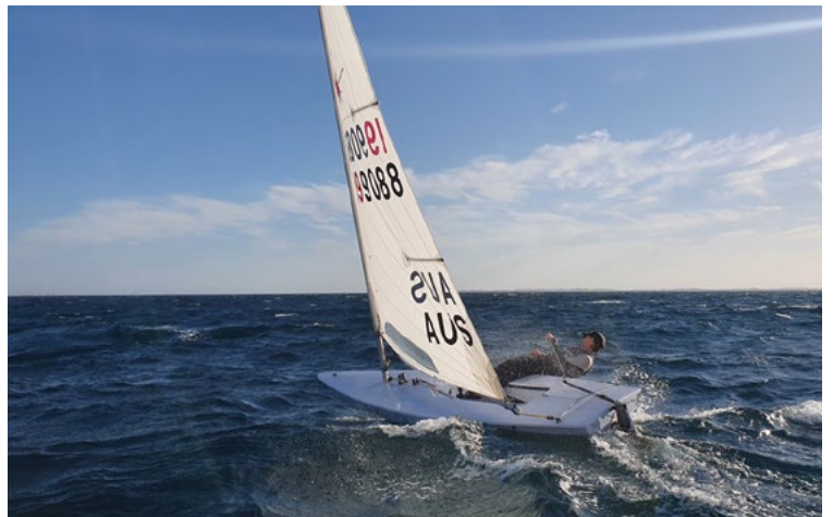
below: Sailing off Fremantle during Summer.