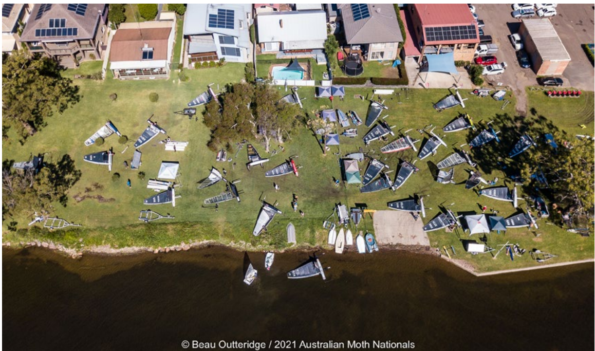
2021 Australian Moth Nationals