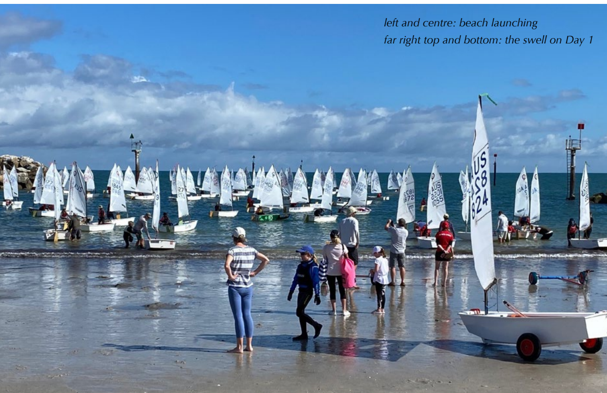
left and centre: beach launching far right top and bottom: the swell on Day 1